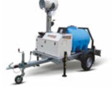
DF 3000 MPT