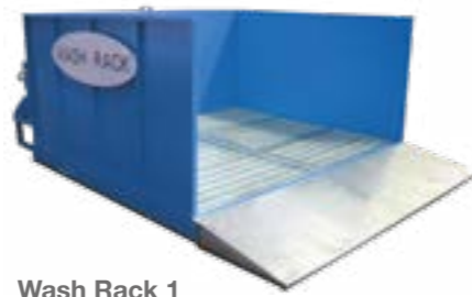
Wash Rack 1