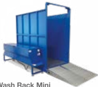
Wash Rack Mini