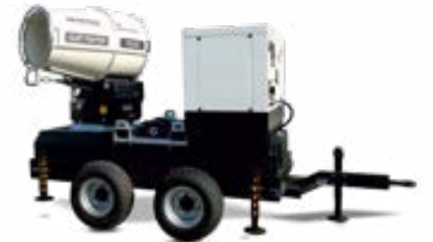
DF 7500 MPT