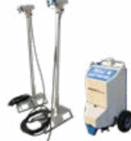
DF Mini Duo ASB