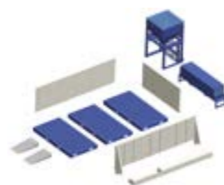
Modular Wash Rack