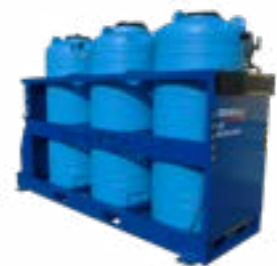
3000 liters filtering system