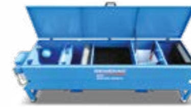
600 liters filtering system